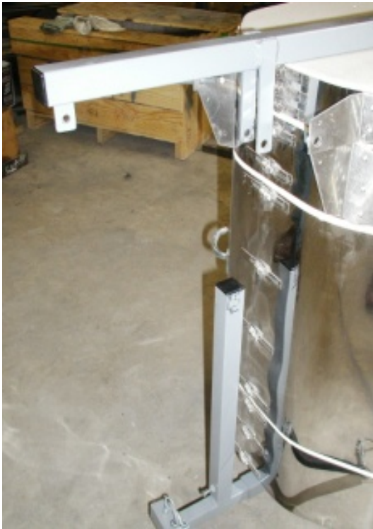
Insert horizontal back support frame to frame pieces on stand.