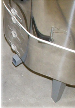
Position kiln floor and rings on stand with hose clamps on the stainless steel jacket facing the back supports.