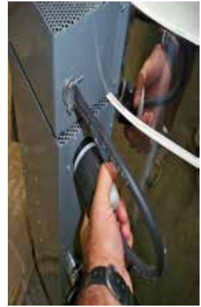
Plug in twist 'n lock interbox plugs and receptacles.