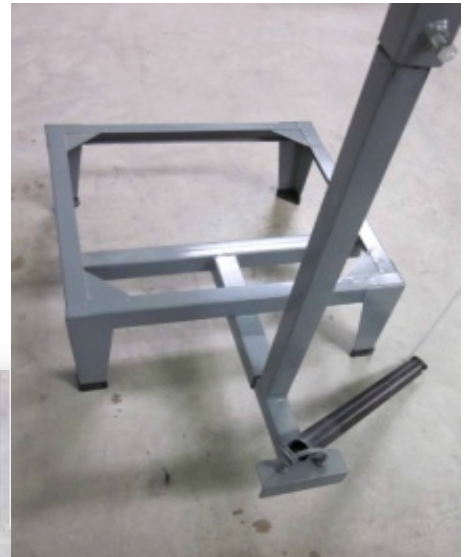
Insert vertical back support frame until pieces lock in place.