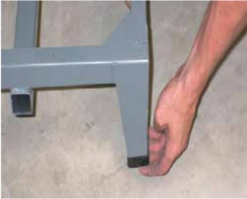
Attach feet onto legs of stand.